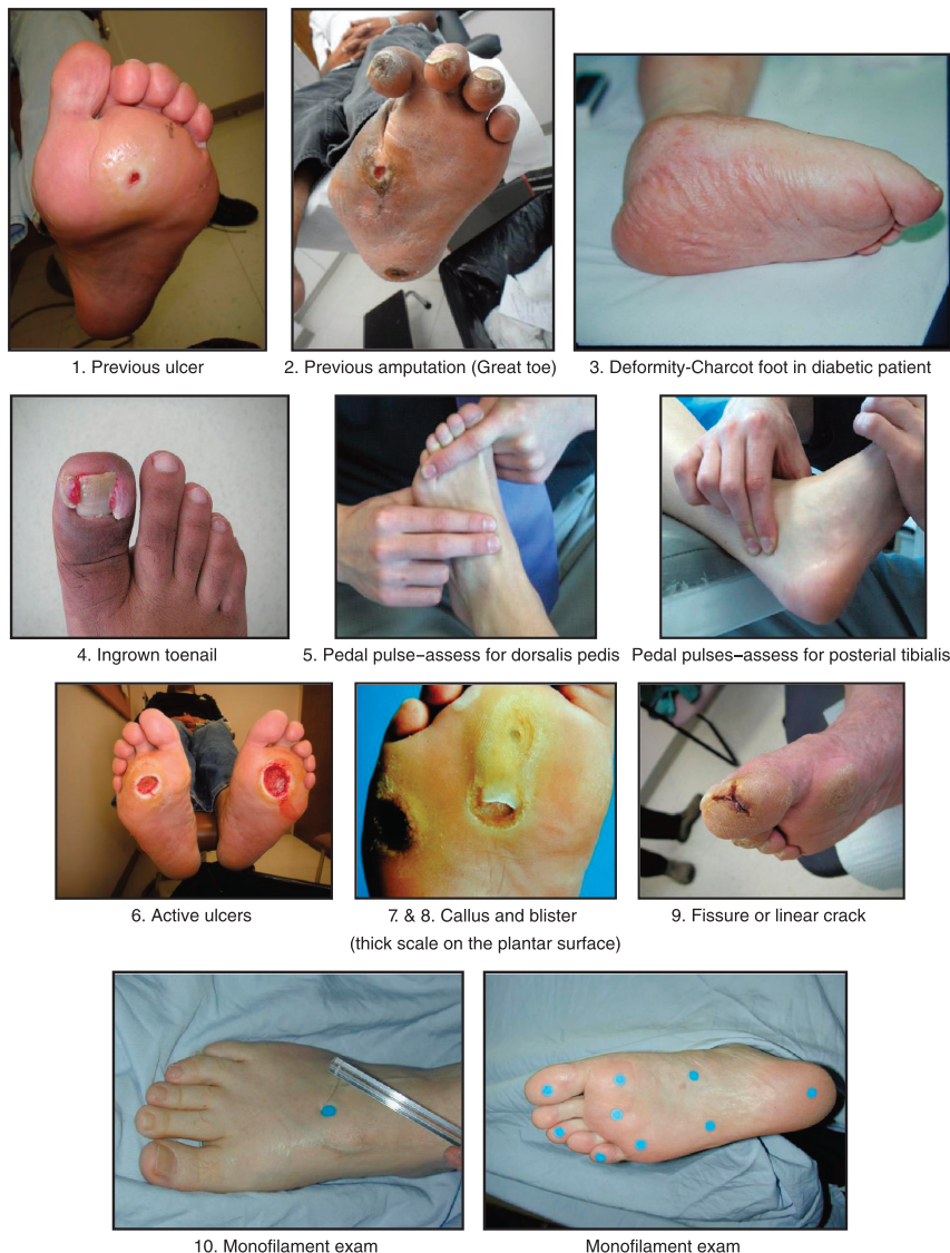
Figure 2. 10 STEPS OF EXAMINATION

associated with pain. This disorder starts with edema, and as the joints are distended, the bones collapse and fragment, leaving behind debris as they dislocate. The foot is distorted with this process of healing over 6 to 9 months. The resultant fixed deformity may include a rocker bottom foot. The clinician should examine the foot for abnormal contours. The contralateral foot, if normal, may be used for a comparison. The changes can be present in the forefoot, midfoot, hindfoot, or heel area, as well as the ankle. In the acute stage, there needs to be immobilization and