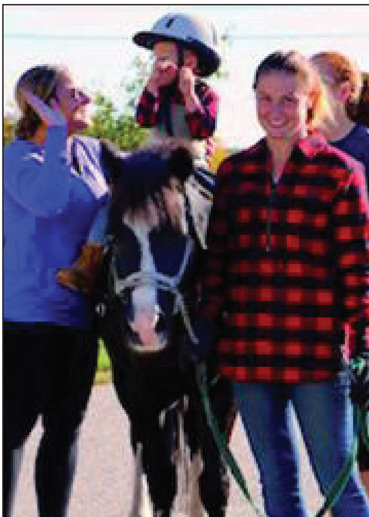
University of New England students worked in an equine therapy program with children this fall at Carlisle Academy in Lyman.

LYMAN—Carlisle Academy, a premier integrative riding school in Lyman, has partnered with the University of New England to introduce future occupational, physical and speech therapists to equine therapy.