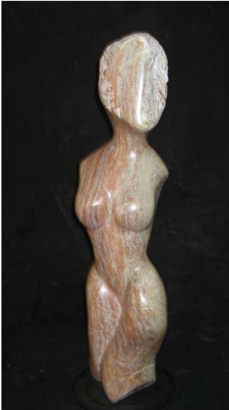
A Beautiful Mind , 2014, alabaster, 29" x 9"