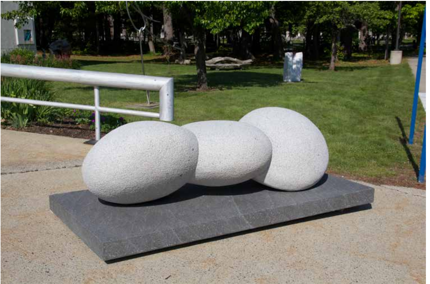
Composition Trio , 2015, granite, 4' x 8' x 3'