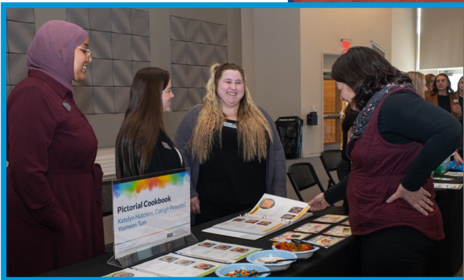
Top: Students during the Adaptive Project Expo