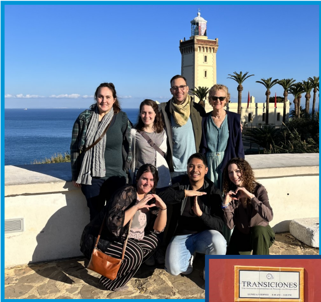
Left: Students and faculty in Morocco