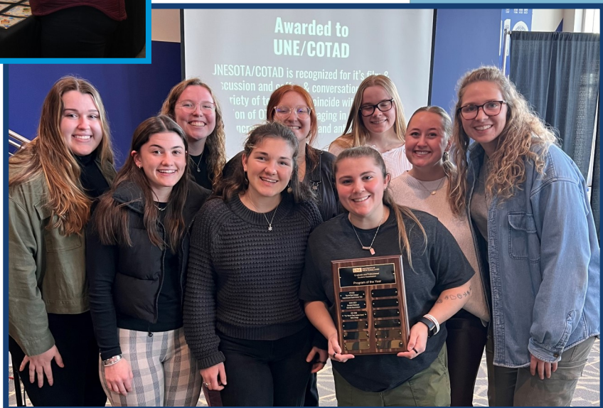
Right: Program of the Year Award