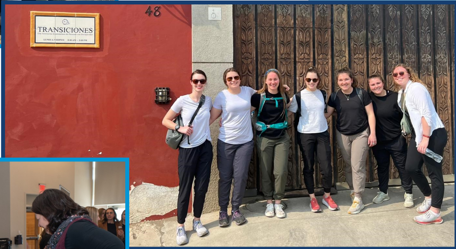
Bottom: Students at Transiciones, a mobility clinic in Antigua, Guatemala