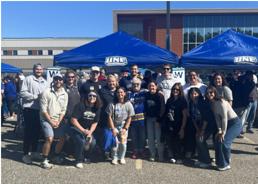
Above: UNE MSOT Faculty and Students at the 2024 Homecoming Tailgate.

We welcomed many UNE MSOT alumni to our annual tailgate event at Homecoming this year. During Homecoming, two of our alumni were inducted into the UNE Varsity Club Athletics Hall of Fame. As always, we loved catching up with current and former students while enjoying tailgate food and fun! We look forward to seeing you all at the next Homecoming Tailgate on Saturday, October 25th, 2025 at the Blue Storm Stadium!