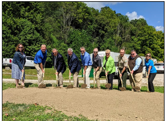
Several state and local officials attended the ground breaking celebration.