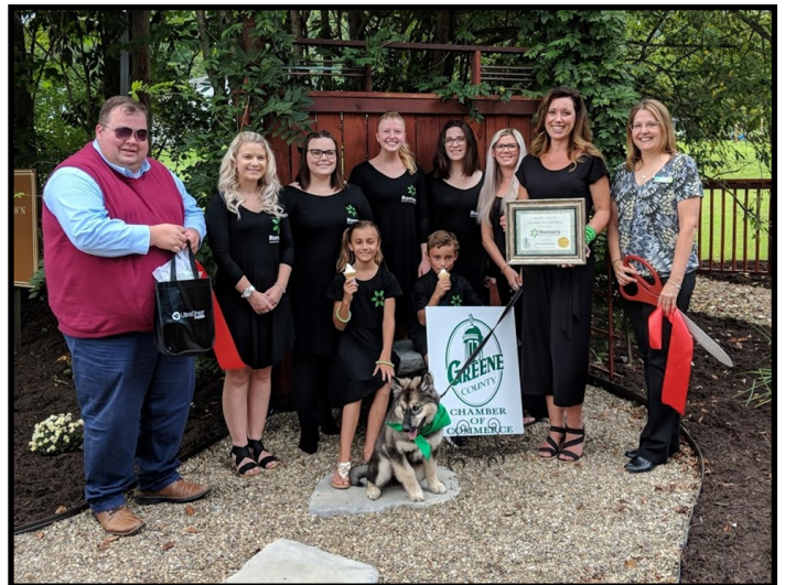
The great team of Roman's!